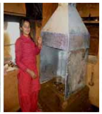
AWASUKA PROGRAM: Smokeless Chimneys